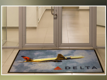
WaterHog Impressions HD®