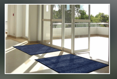
ColorStar® (PET fabric features 100% recycled content reclaimed from plastics)

www.mamatting.com 800.241.4696 (Dalton, GA) 800.241.5549 (LaGrange, GA)