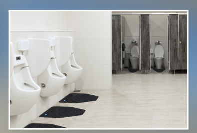
CleanShield® Restroom Mats